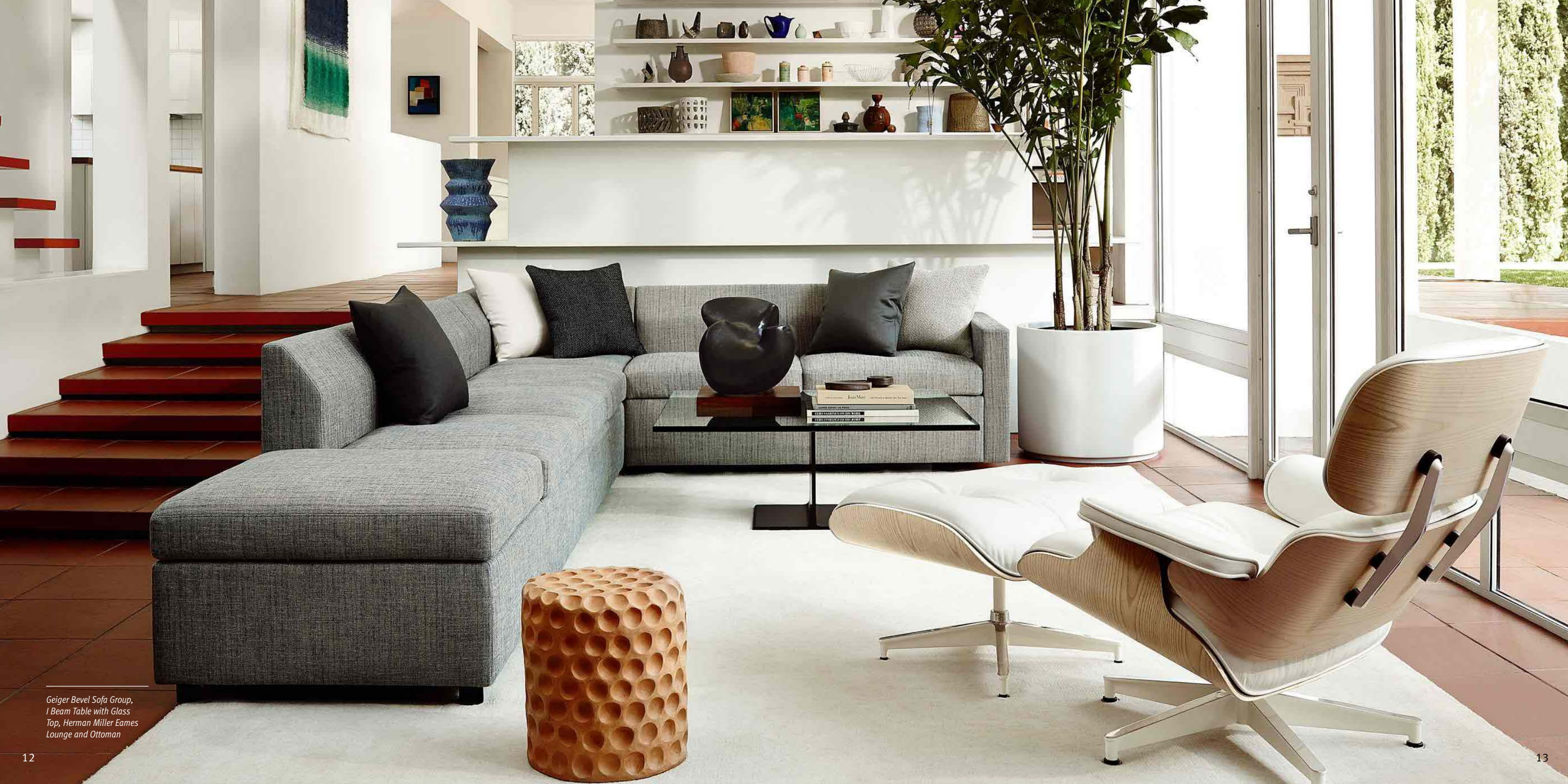
Geiger Bevel Sofa Group, I Beam Table with Glass Top, Herman Miller Eames Lounge and Ottoman