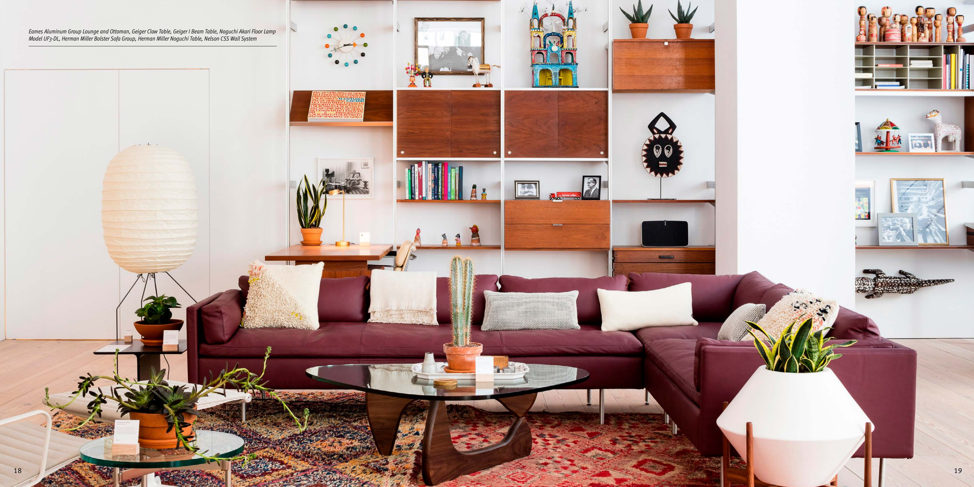
Eames Aluminum Group Lounge and Ottoman, Geiger Claw Table, Geiger I Beam Table, Noguchi Akari Floor Lamp Model UF3-DL, Herman Miller Bolster Sofa Group, Herman Miller Noguchi Table, Nelson CSS Wall System