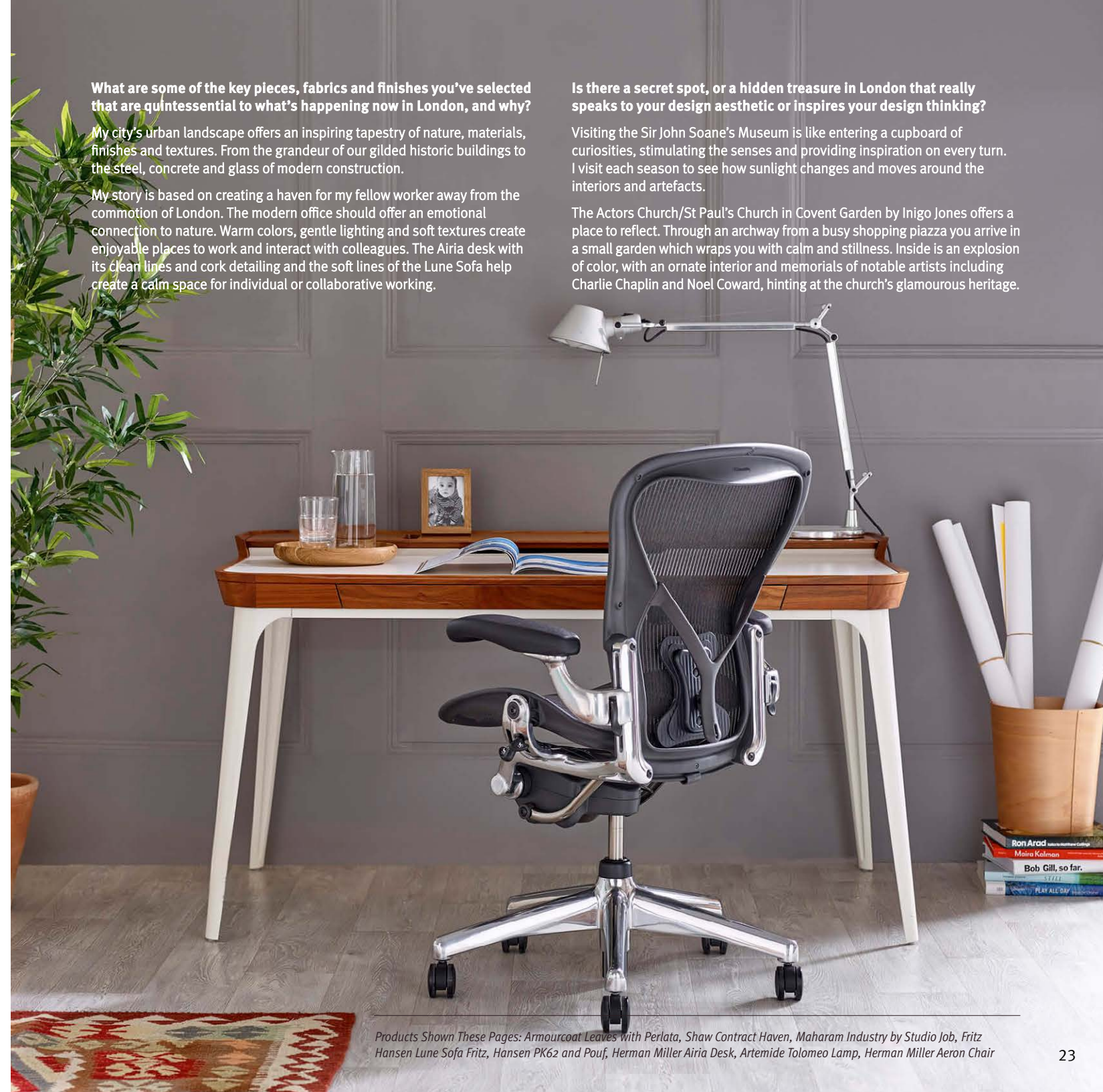
Products Shown These Pages: Armourcoat Leaves with Perlata, Shaw Contract Haven, Maharam Industry by Studio Job, Fritz Hansen Lune Sofa Fritz, Hansen PK62 and Pouf, Herman Miller Airia Desk, Artemide Tolomeo Lamp, Herman Miller Aeron Chair

The Actors Church/St Paul's Church in Covent Garden by Inigo Jones offers a place to reflect. Through an archway from a busy shopping piazza you arrive in a small garden which wraps you with calm and stillness. Inside is an explosion of color, with an ornate interior and memorials of notable artists including Charlie Chaplin and Noel Coward, hinting at the church's glamorous heritage.